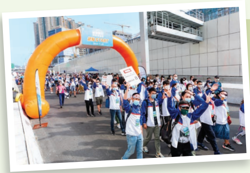
集團員工與其家人參與百萬行，為公益金的家庭及兒童福利服務籌款。 Staff of the Group took part in the Walk together with their family to raise funds for family and child welfare services supported by the Community Chest.

Chevalier Group has been supporting and encouraging its staff to engage in volunteering and contributing to society. The Community Chest's Walk for Millions had been held virtually for two consecutive years due to COVID-19. On 20 November 2022, the New Territories Walk for Millions 2022/23 was held at the Cross Bay Link of Tseung Kwan O, which is the first in-person Walk for Millions since the outbreak of the pandemic.