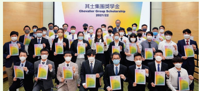
於2021/22學年，共有40位優秀工程學生獲頒發獎學金。 40 talented engineering students received the sponsorship award in the academic year 2021/22.

Since 2018, Chevalier Group has founded Chevalier Group Scholarship in recognition of the outstanding academic achievements of VTC students of full-time Higher Diploma Programmes and Diploma of Vocational Education Programmes in the Engineering Discipline. The scholarship aims at nurturing young professionals in the fields of engineering and construction, and driving sustainable development in the industry.