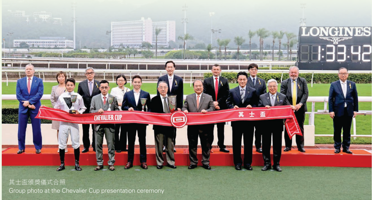
其士盃頒獎儀式合照 Group photo at the Chevalier Cup presentation ceremony