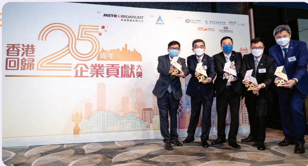
五個獲獎業務的管理層拿著獎座合影。 Management from the five awarded business units took photo with the award trophies.