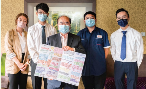
得獎學生送上感謝卡。 A thank you card is presented by the awarded students.

其士集團自2018年為就讀職業訓練局全日制工程學科高級文憑和職專文憑學生設立「其士集團獎學金」，以表揚及獎勵出色學術表現的學生。獎學金旨在為工程及建造業培育年輕專業人才、推動業界可持續發展。