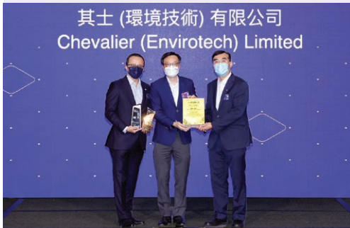
其士（環境技術）有限公司 Chevalier (Envirotech) Limited